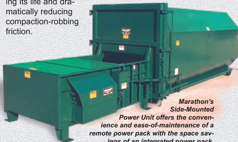
Marathon's Side-Mounted Power Unit offers the convenience and ease-of-maintenance of a remote power pack with the space savings of an integrated power pack.

The packing ram is supported and guided by specially formulated cast iron shoes which ride on replaceable wear strips. This exclusive design protects the charge box floor from the full force of the packing ram, extending its life and dramatically reducing compaction-robbing friction.